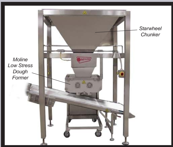
Starwheel Chunker with Low Stress Dough Former